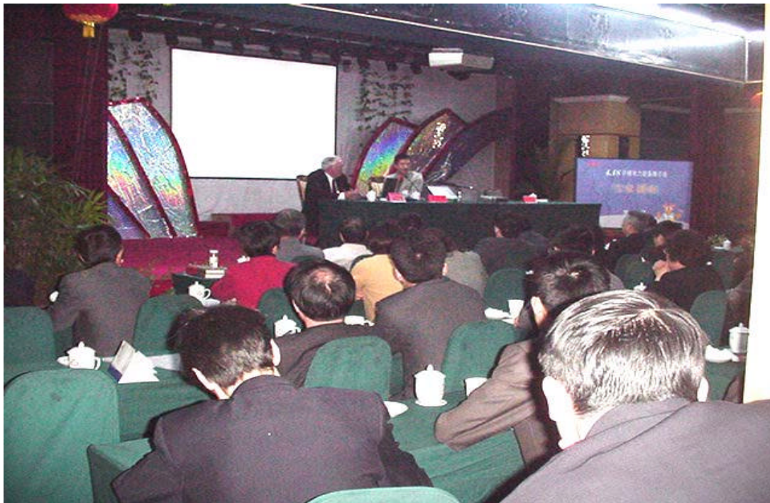
The Technical Presentation Session

XJ Group is the biggest power equipment manufacturer in China and owns two public companies. Please refer to www.xjgc.com for details