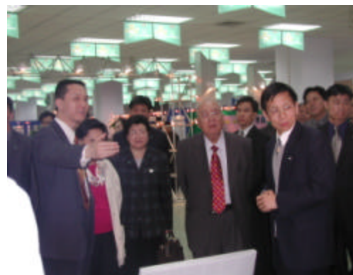
Vice-Chairman of the China Congress Central Committee visited the exhibition