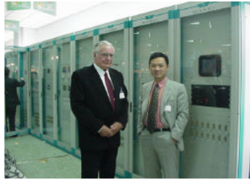
The Substation Automation & Condition Monitoring Booth